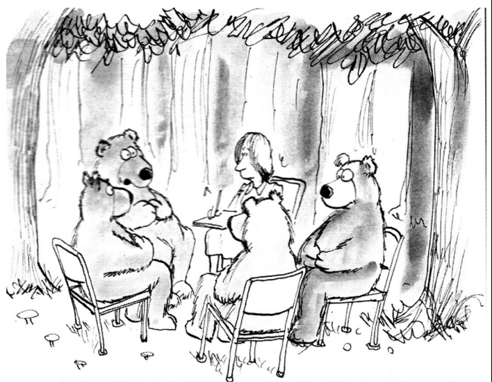
"I still resented her until I did my Fifth Step. My sponsor said, 'All that anger over a little porridge?'"

First, make sure your MASK is secure. Then, help those you sponsor.