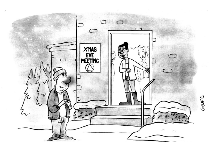
"Rudy, with your nose so bright, won't you join our meeting tonight?"

ONLY DRINK ON WEEKENDS? "You might be an alcoholic if"