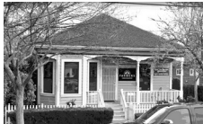
Central Office is located in the back

Central Office: 159 East D St., Benicia, CA 94510—(707) 745-8822