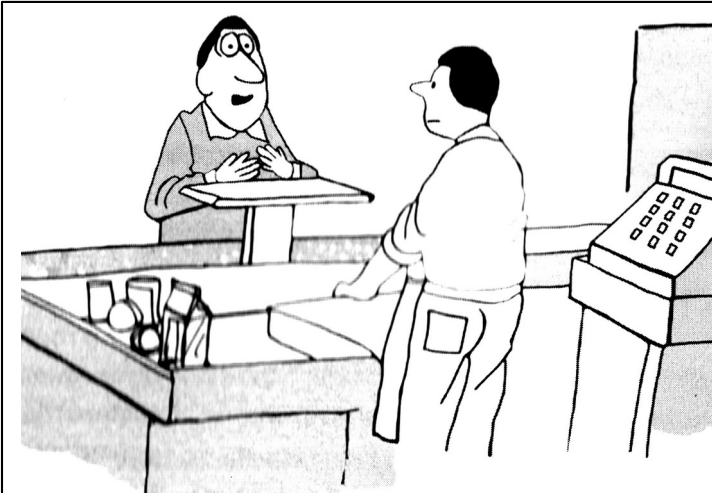
"I just wanted you to know that I made it through the liquor aisle without going nuts."