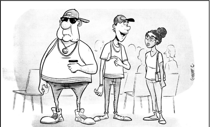
"My sponsor HAS been a good influence on me, of course...but I like to think I've been an influence on him,too!"